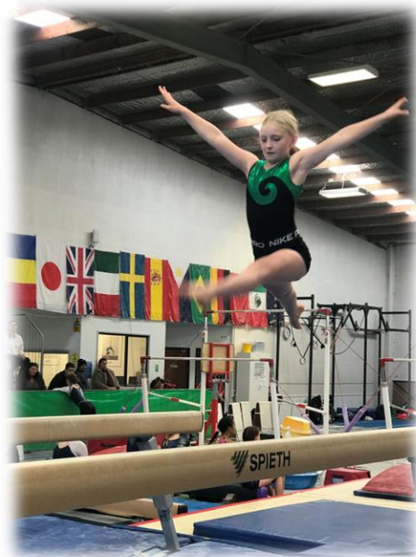
Images (left to right): MMI Production, Super 11 Indoor Rock Climbing and Gymsport Competition