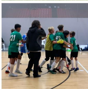
Images: DanceBrandz team, AIMS girls water polo and boys futsal teams