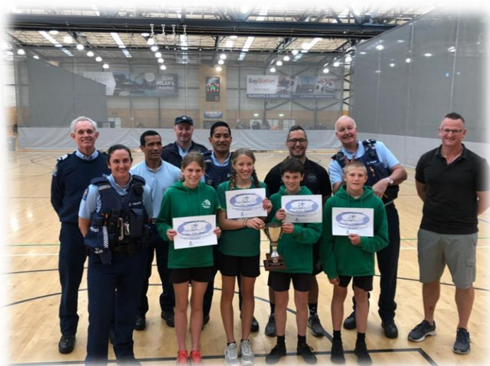
Images: MMI team at the Police Blue Light PCT Challenge 2022