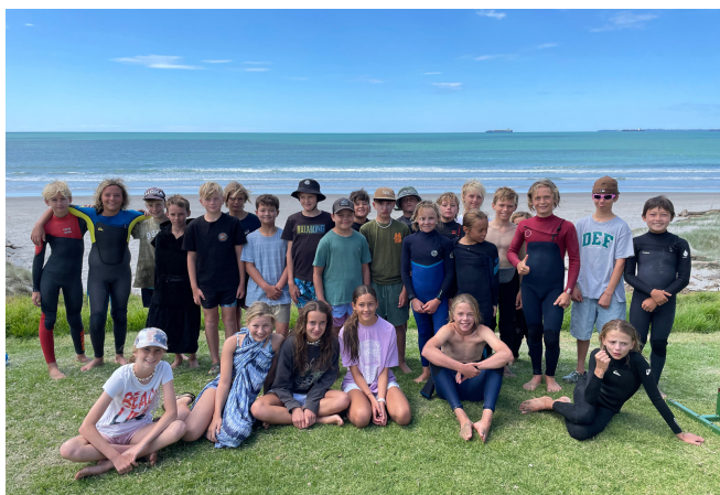
Image: students at trials for the 2023 MMI surf team