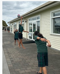
Image: students out and about at break times