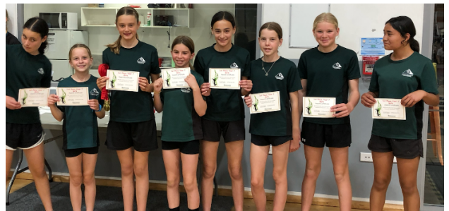
Year 7 Girls