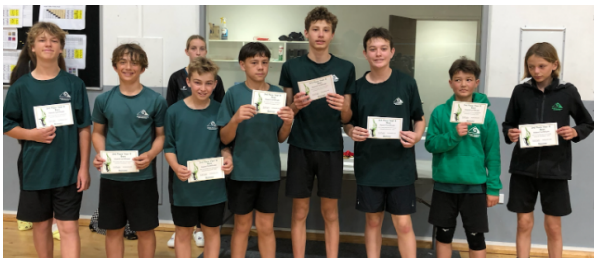
Year 8 Boys