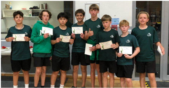
Year 7 Boys

A huge thank you to all those that coached and were available to support our tamariki on the day. It is also lovely to see so many whanau come and support our teams.