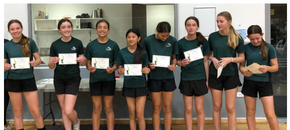
Year 8 Girls